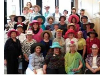
May Brunch, 2016

Including Member Recognition, Awards, and Installation of New Officers