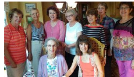
Lunch & Lit III, 2015