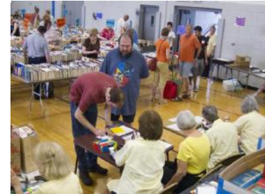
Thursday night sale, 2015